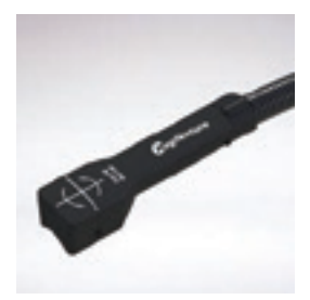
Rat Coil*(not for human use)