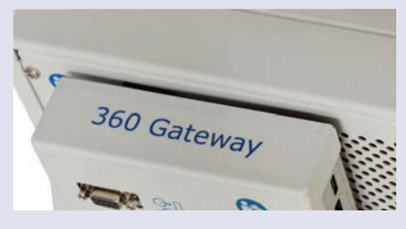
A 360 gateway attached to the rear panel of the stimulator

The MagVita 360® solution consists of very few elements that can easily be integrated in your current MagVenture TMS Therapy system or delivered fully installed in a new one. All you need are these components: