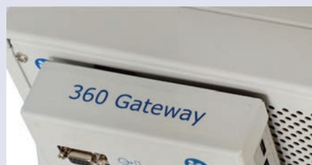
A 360 gateway attached to the rear panel of the stimulator