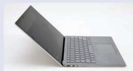
A pc/laptop (not supplied) with internet connection

The Patient Management system may also be purchased as a stand-alone software solution which is also cloud-based but relies on manual data entry.