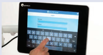
Monitor/touch screen mounted on the trolley