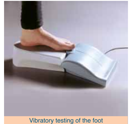
Vibratory testing of the foot