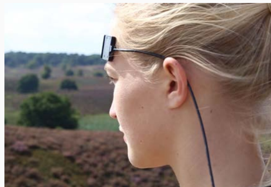
Applications of the PortaLite

Quotation? contact us at: askforinfo@artinis.com